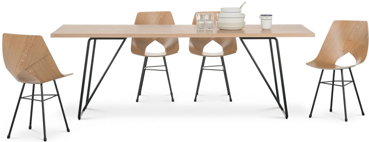
LIMI chair & FRONT table Design: Tapio Anttila