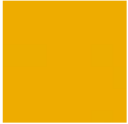
Gold yellow RAL 1004