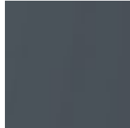
Iron grey RAL 7011