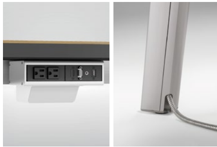
Table top is 30mm thick. Inspired by the slenderness of a brushstroke, the surface is complemented by an elegantly designed frame that guarantees both stability and maximum leg room. Clear lines, and a lightness that makes the table appear longer, thinner, linear and narrow.